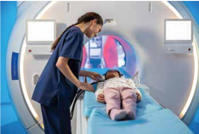
The images above show examples of the look and feel of the future Ambient Experience MRI.

The new MRI expansion project is slated to be complete in March of 2026 with the current mobile MRI unit service available until the project is complete.