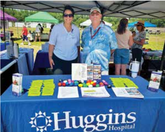
Wolfeboro Farmers Market