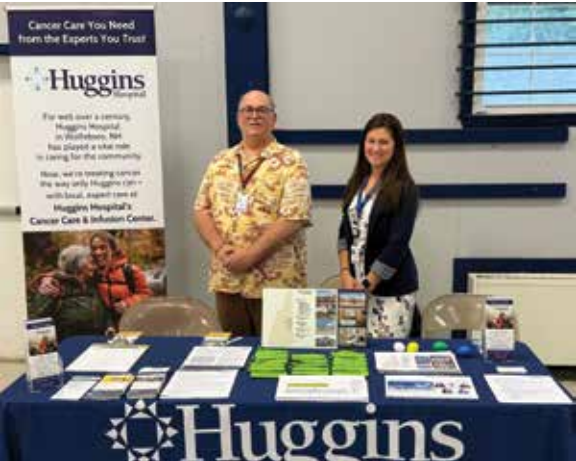
Ossipee Round Table's Community Connection

Huggins Hospital staff shared information at multiple events in our communities including The Ossipee United Round Table's Community Connection Event at the Ossipee Town Hall, the Senior Health & Fitness Day Fair at Pop Whalen Ice & Arts Center in Wolfeboro and the Wolfeboro Farmers Market. We enjoyed getting to meet our community members at these events. We hope to see you at future events!