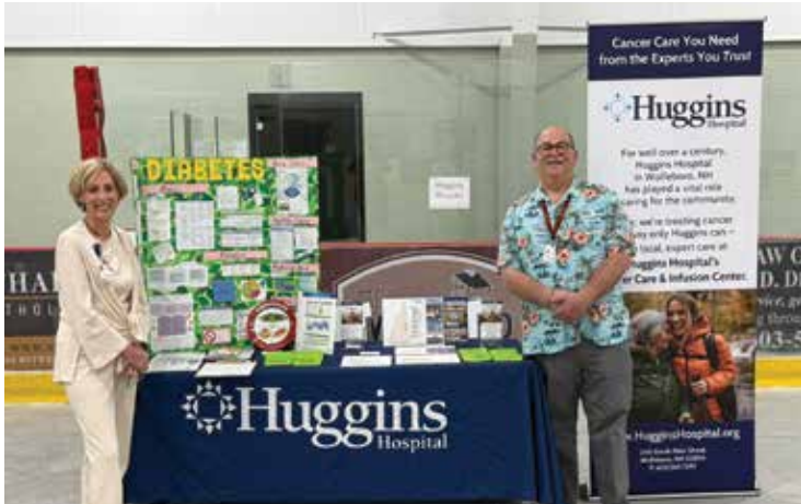
Senior Health & Fitness Day